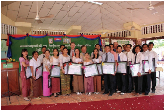
Group photo of AHC staff and FWAB's Board of Directors during anniversary 2011

The Founder, The Board of Directors of Friends Without A Border (FWAB), and the Director of Angkor Hospital for Children (AHC) in Siem Reap celebrated the 12 th anniversary of AHC on 29 th January 2011 at Angkor Hospital for Children. Honored guests included invitees from the board's directors, donors from around the world, staff, as well as volunteers. The morning began at 8:00am and included an introduction about Angkor Hospital for Children's projects, speeches from the keys persons from FWAB, AHC, and a short