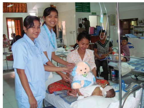
Staff nurses distribute donated teddy bear to the children in IPD

In the mean time, please visit our website at www.angkorhospital.org . The website includes AHC activities and other ways you can get involved if you are interested. Our success depends on good relationships and a growing number of people believing in our vision.