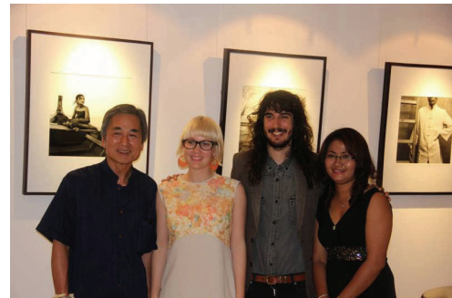
AHC's Founder and Friends Center team during reception evening

We would like to thank to all guests, sponsors and supporters for generously donating their time and money to help the sick children at AHC.